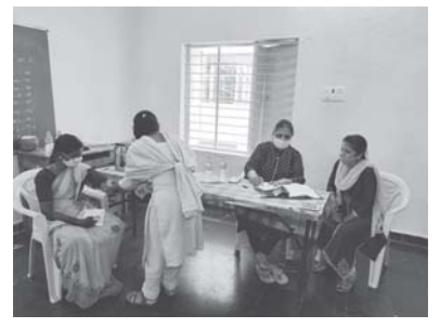
Free medical camp by Tos, Amarapuram group