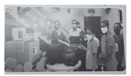
One desktop and 10 Laptops donated by Mind Tree are handed over to the inmates of Prativa Ashram