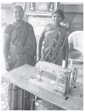
TOS Akot group donating a sewing machine to poor woman for helping her family's livelihood.