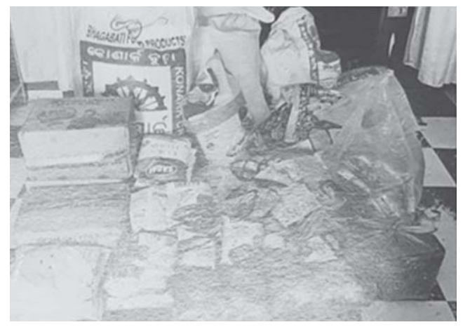
Groceries donated to Ashakiran Oldage Home

Groceries for one month provided to the inmates of Adruta Children Home