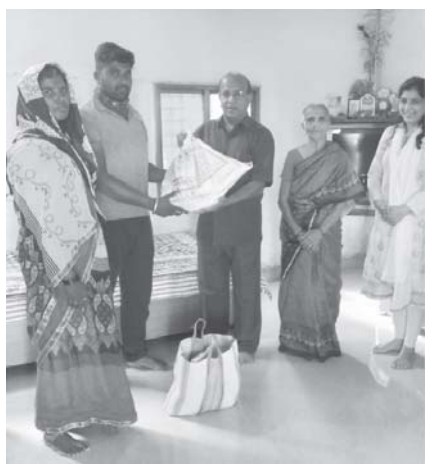
TOS group Akot giving household materials to poor family members of burnt house.