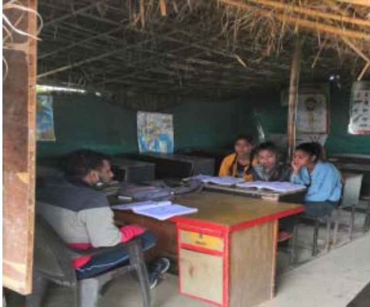
Skill development for Rural students