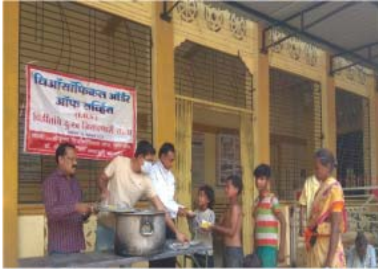
Distribution of food to eat to street persons by Amravati group.