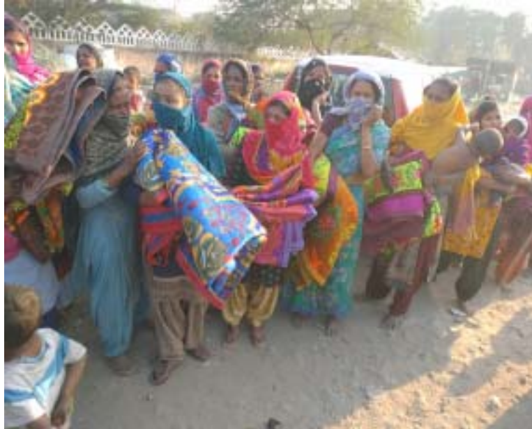
Winter clothes and blankets distribution