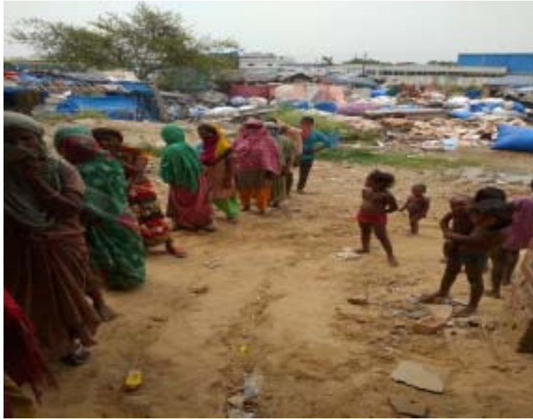
Food/Rations distributed during Lockdown to rural needy community in Delhi NCR for 150 days without break by Sanatan Noida Group.