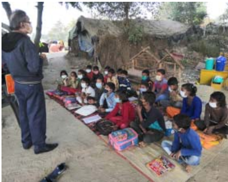
Educational training of labourers children