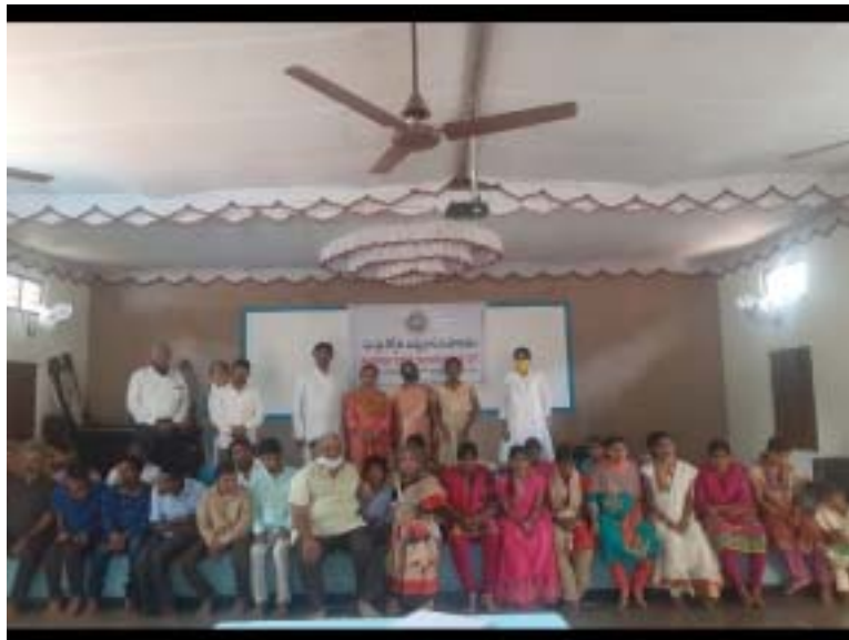
Secunderabad group activities