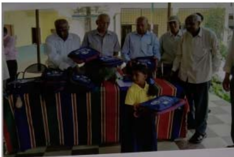
Student Receiving School Bags