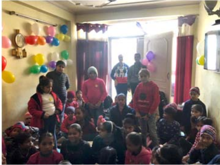
Summer Camp – Jun 2020