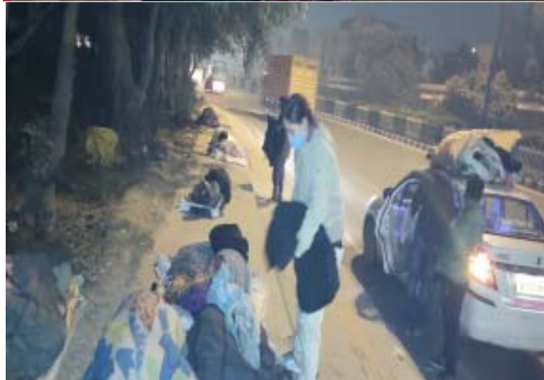
Help to Road side dwellers with food and clothing