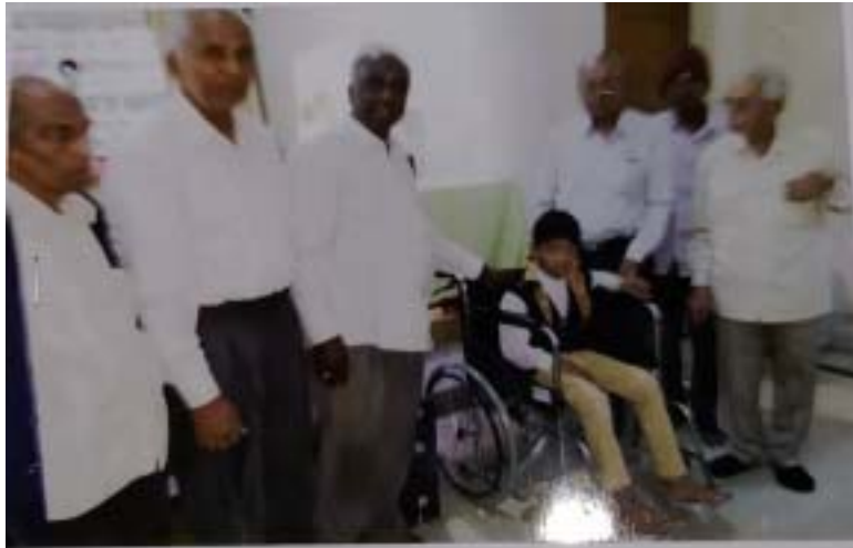
Distribution of wheel chair to the Disabled Person