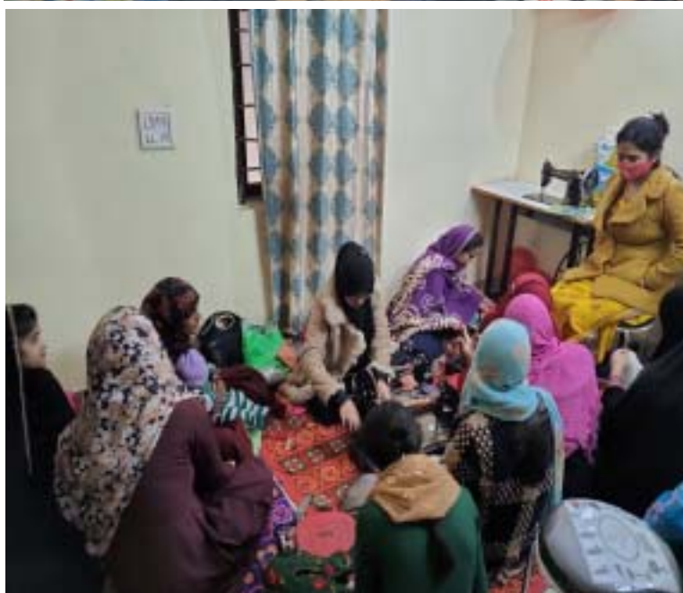
Stitching and Tailoring training for Rural women