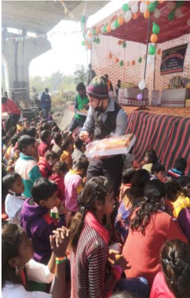
Republic day celebration