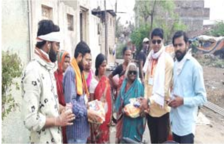
Akot group organised to distribute food stuffs to families in villages during early lockdown period of April 2020.