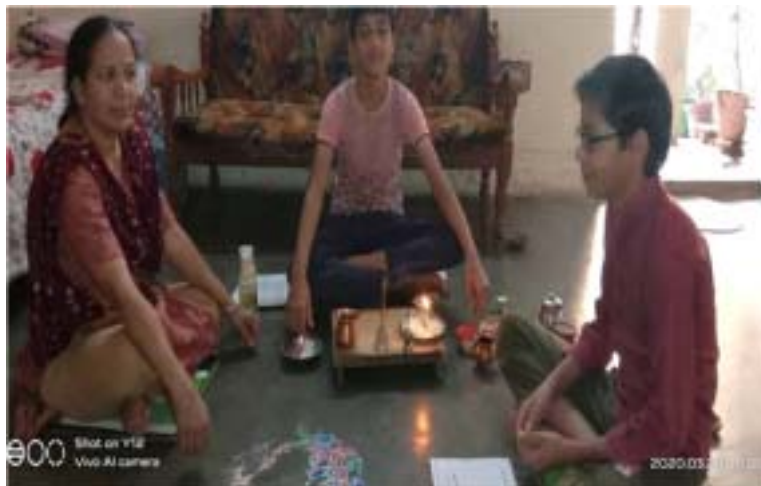
Healing rituals at home at Nagpur