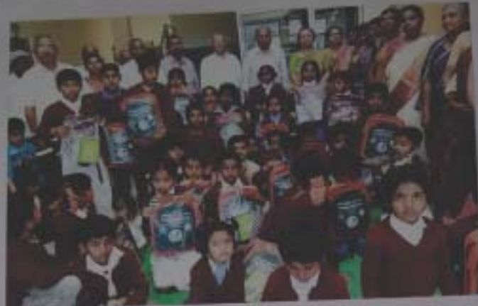
Distribution of Wollen Substrates and School bags to School Students of Rural Place on 23 rd February 2020