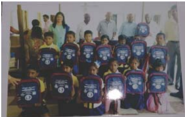
Students with school Bags & Study materials