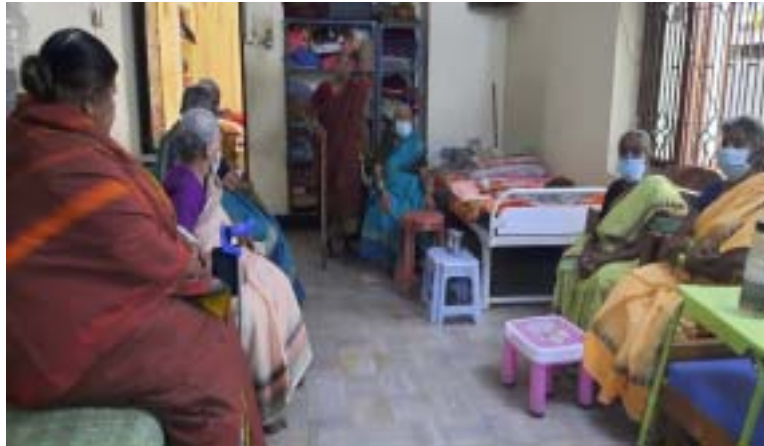
Rayadurgam group service activity