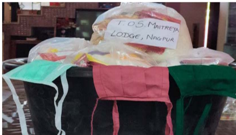
Distribution of masks to poor people by Nagpur (Maitreya) group